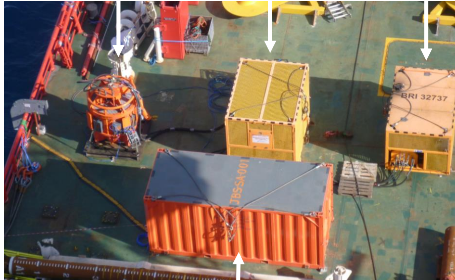
Control Room / Workshop