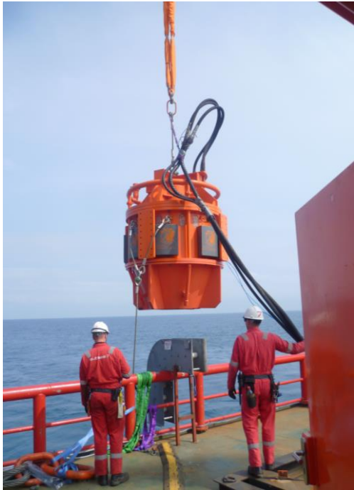
Sea Axe CFE Excavator